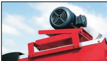
ELECTRIC MOTOR DRIVE