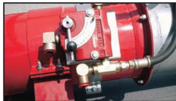
HYDRAULIC MOTOR DRIVE FLOW CONTROL VALVE STANDARD