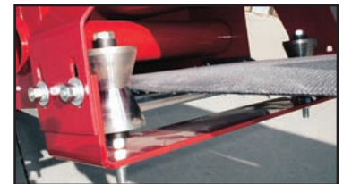
BELT ALIGNMENT ROLLER GUIDE